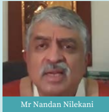
Mr Nandan Nilekani